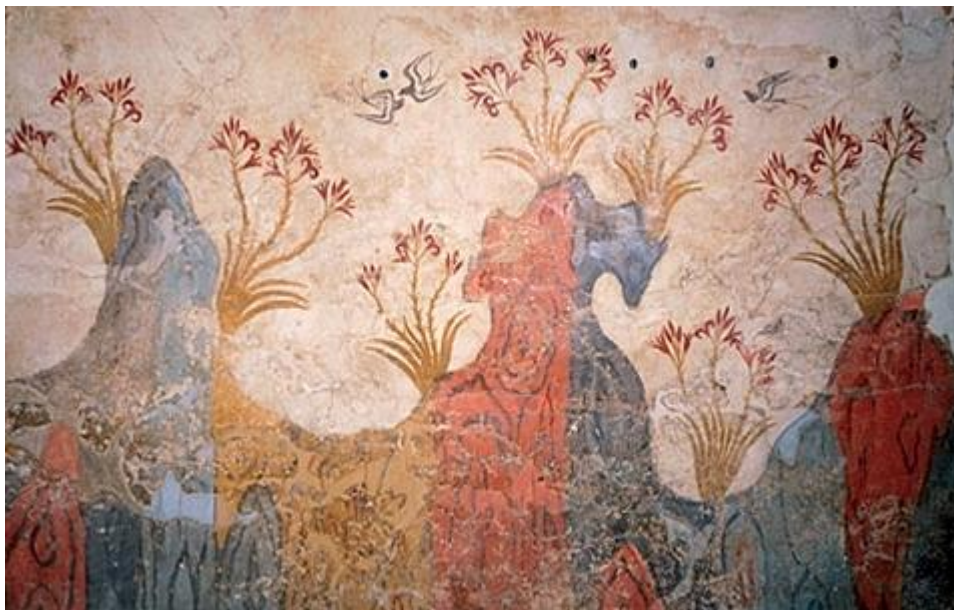
Minoan fresco of Pancratium maritimum – The Sea Daffodil