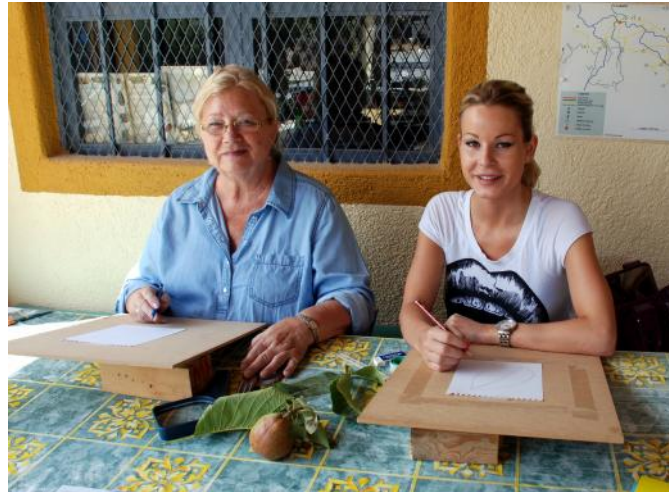
Mother and daughter from Norway on a beginners' botanical art course in 2010