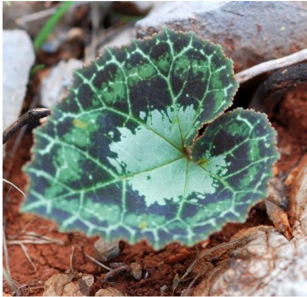
Wild cyclamen leaf