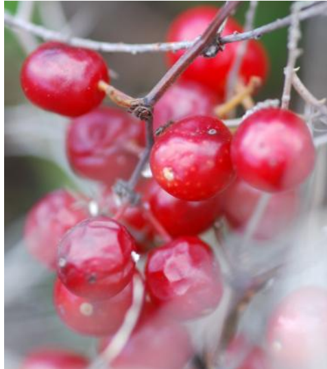
Smilax berries in autumn - Afrata

Session Sixteen: Beginning shading and learning how to depict dewdrops and the shine on fruits and berries.