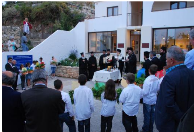
Dedication of Museum of Cretan Flora in 2010