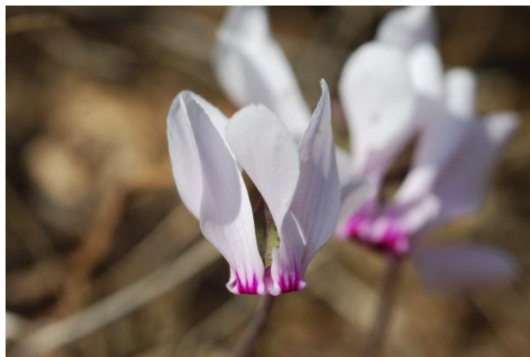
Cyclamen graecum ssp graecum growing in abundance at Afrata

Session Four: Field trip to Afrata to find wild cyclamen, crocus and squill. The hillsides around this small traditional village are covered with autumn flowering bulbs in October. A chance to draw and photograph these beautiful flowers in situ.