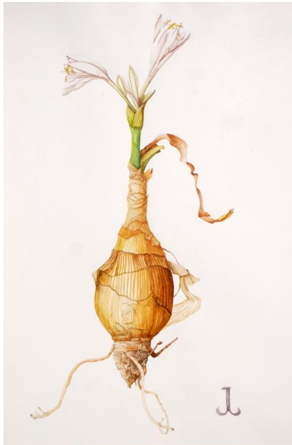
Watercolour study of The Sea Daffodil © Julia Jones