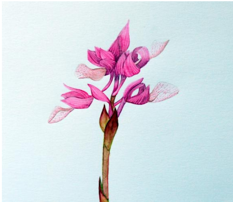
Detail of endemic Orchis papilionacea ssp alibertis © Julia Jones

'Julia is a botanical artist, who taught us watercolour painting one day at her beautiful Cretan village stone-house, the next day under an almond tree up in the mountains, another day we were on hilltop overlooking Spinalonga. We had lunches in small mountain villages and on hidden beaches. We looked for orchids and she learned us about the flowers and plants of Crete. It is the best vacation we ever had, and we are definitely going back next year.'