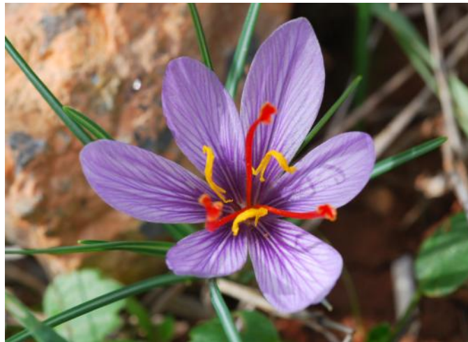
Endemic Autumn Crocus – C. oreocreticus