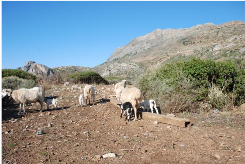
New born lambs at Falarsana in October